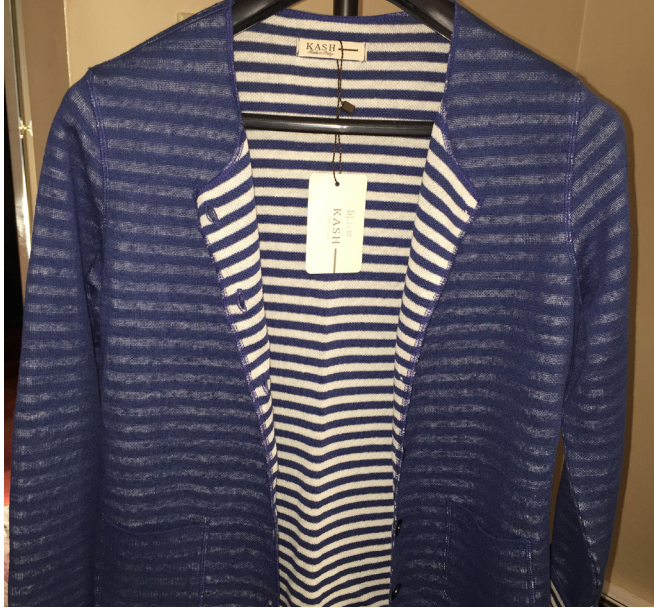
Striped Cotton Sweater Designed by Kash