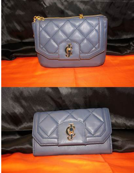
Juicy Couture Purse and Wallet