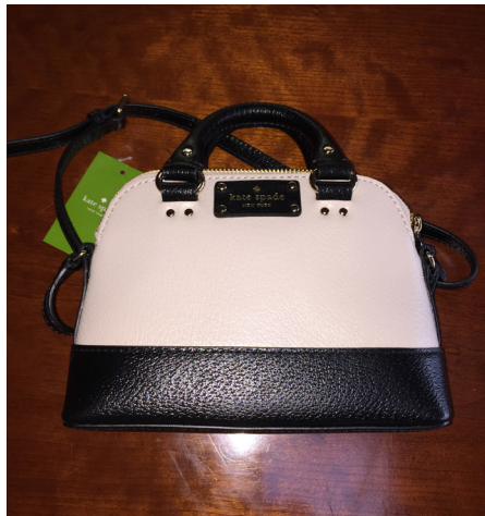
Kate Spade Mini Rachelle Pebble/Black Handbag.