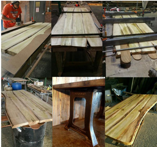
Hand Crafted Poplar Wood and Cast Iron Dining Room Table